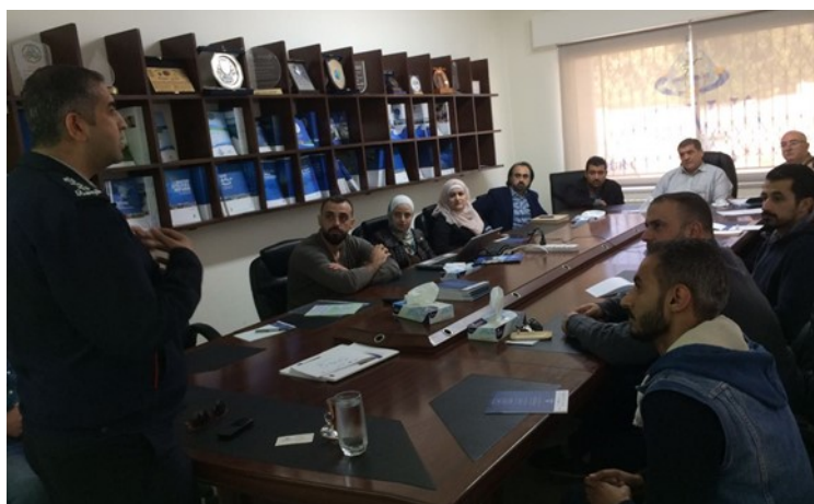
Civil Defense Training for ACWUA's staff